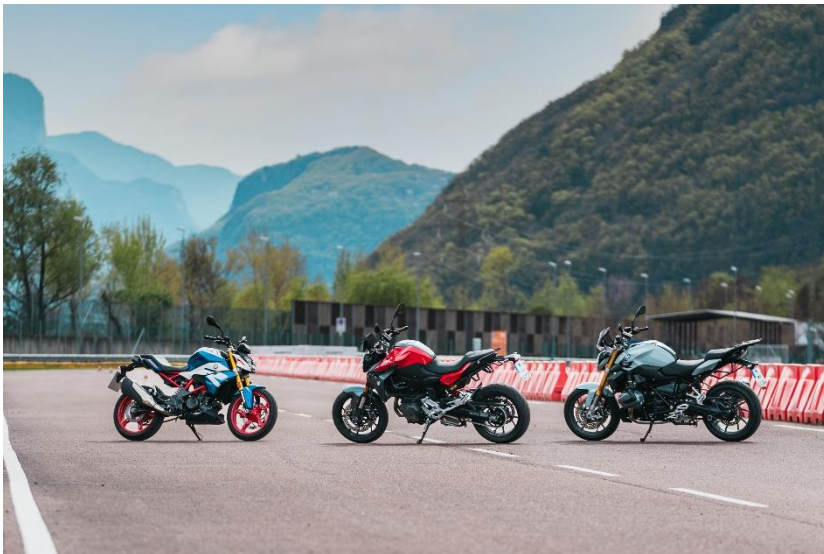
Image 2: With 20 motorcycles, the Riding Experience Alto Adige fleet offers a diverse selection that is available for test rides, training and tours as well as for rental.