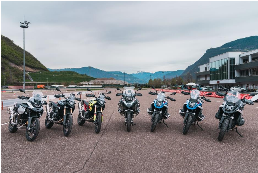
Image 1: BMW Motorrad Test Center Alto Adige with motorcycle fleet. From the 2024 season with brand new models such as the R 1300 GS.